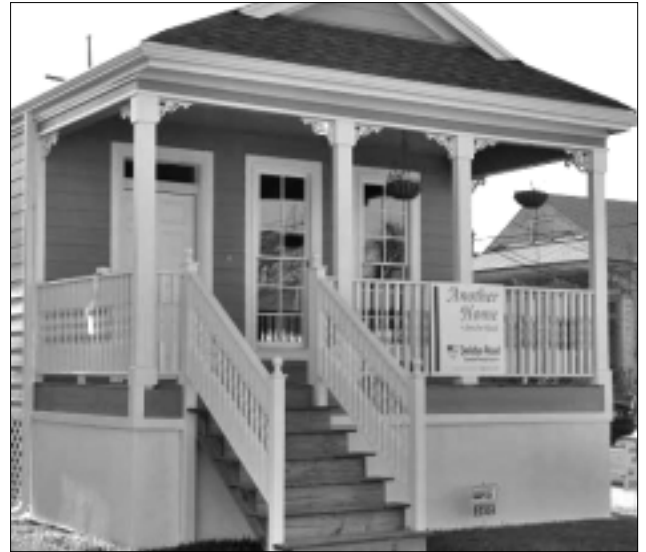
A completed Jericho Road house in New Orleans. Come be a part of this amazing Katrina recovery ministry.