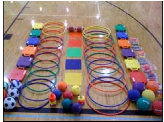
The My Coke Rewards Ultimate PE Pac

You can help reach the next goal by donating your "My Coke Rewards" to St. James Day School. Please also save your Community Coffee's "Cash for Schools" labels,