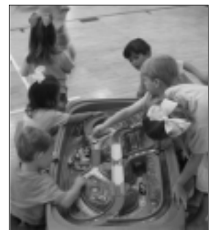
Vacation Church School 2008

On Thursday they put community service in action by offering cold lemonade to passers-by in front of Bishops Hall on a hot morning.