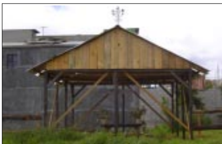
The chapel after the 2008 mission trips.

A team member was heard to say, "We proclaim we are one church, united in mission. This is so true when we work together in a foreign land."